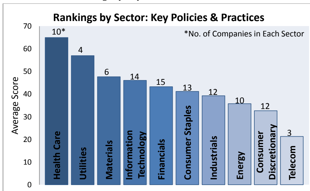
Chart 1: Sector Rankings by Key Policies and Practices

Note: Scores represent the percentage of the maximum score achievable – 25.