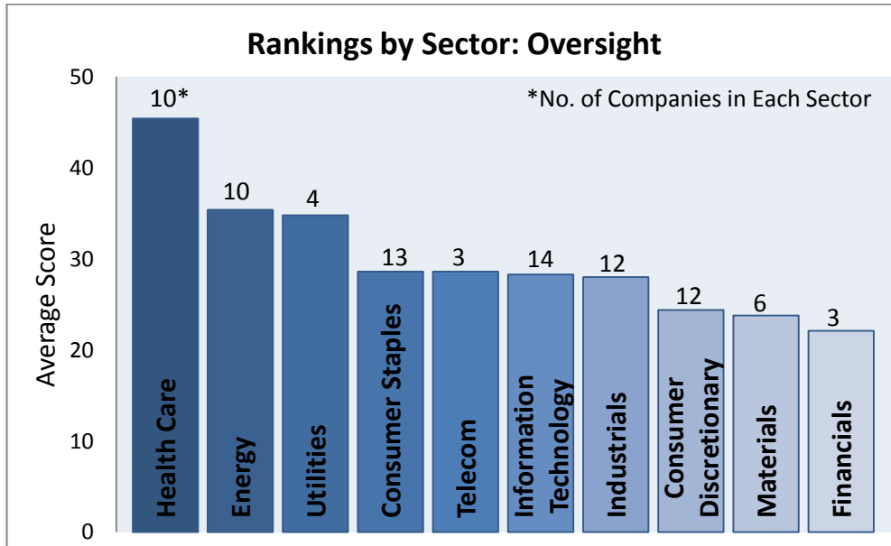
Chart 4: Sector Rankings by Oversight

Note: Averages are based on the percentage of the maximum score achievable – 69.